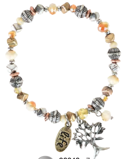
NEW 98348 - 7 7 80308 98348 8