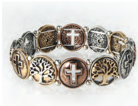
BESTSELLER 98106 - 10 7 80308 98106 4