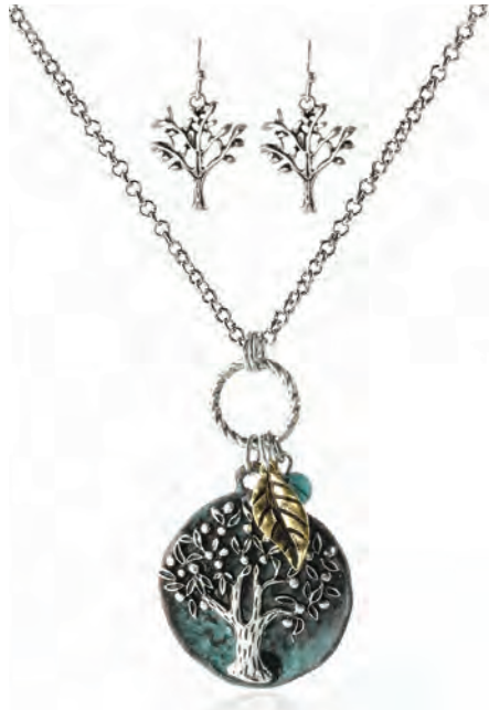
BESTSELLER 98375 - 11 7 80308 98375 4 (20")