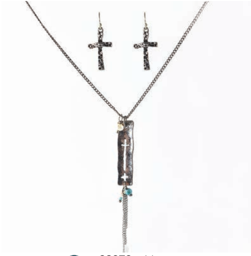
NEW 98379 - 11 7 80308 98379 2