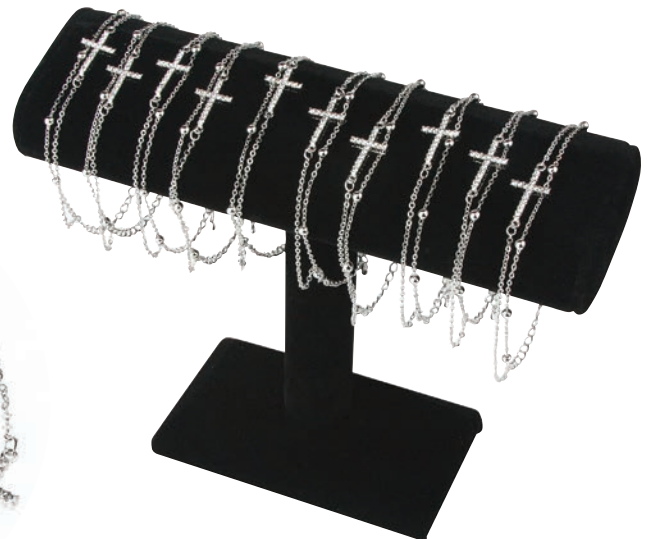
#EMCB10 -75 10 Piece Cross Bracelet Assortment