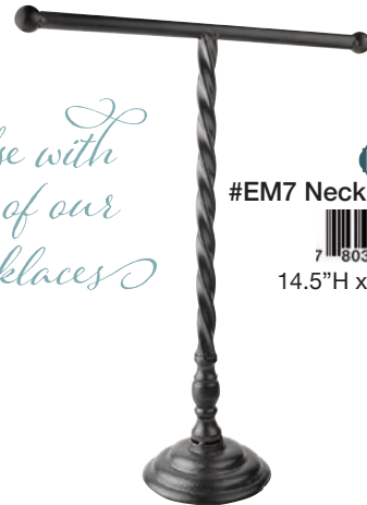
NEW #EM7 Necklace Display -15