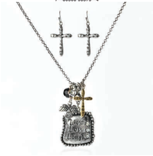
NEW 98377 - 11 7 80308 98377 8