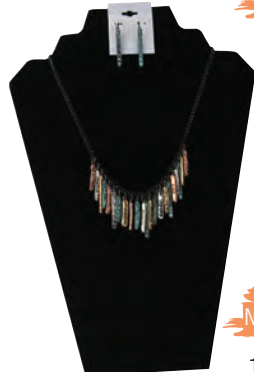
NEW #EM2 Single Necklace Display -2 Easel Backed 12.75"H x 8.5"W x 0.25"D