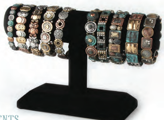
#EMMB10-G - 100 10 Piece Bracelet General Assortment

*FREE DISPLAY with assortment or when ordering any 10 Bracelets