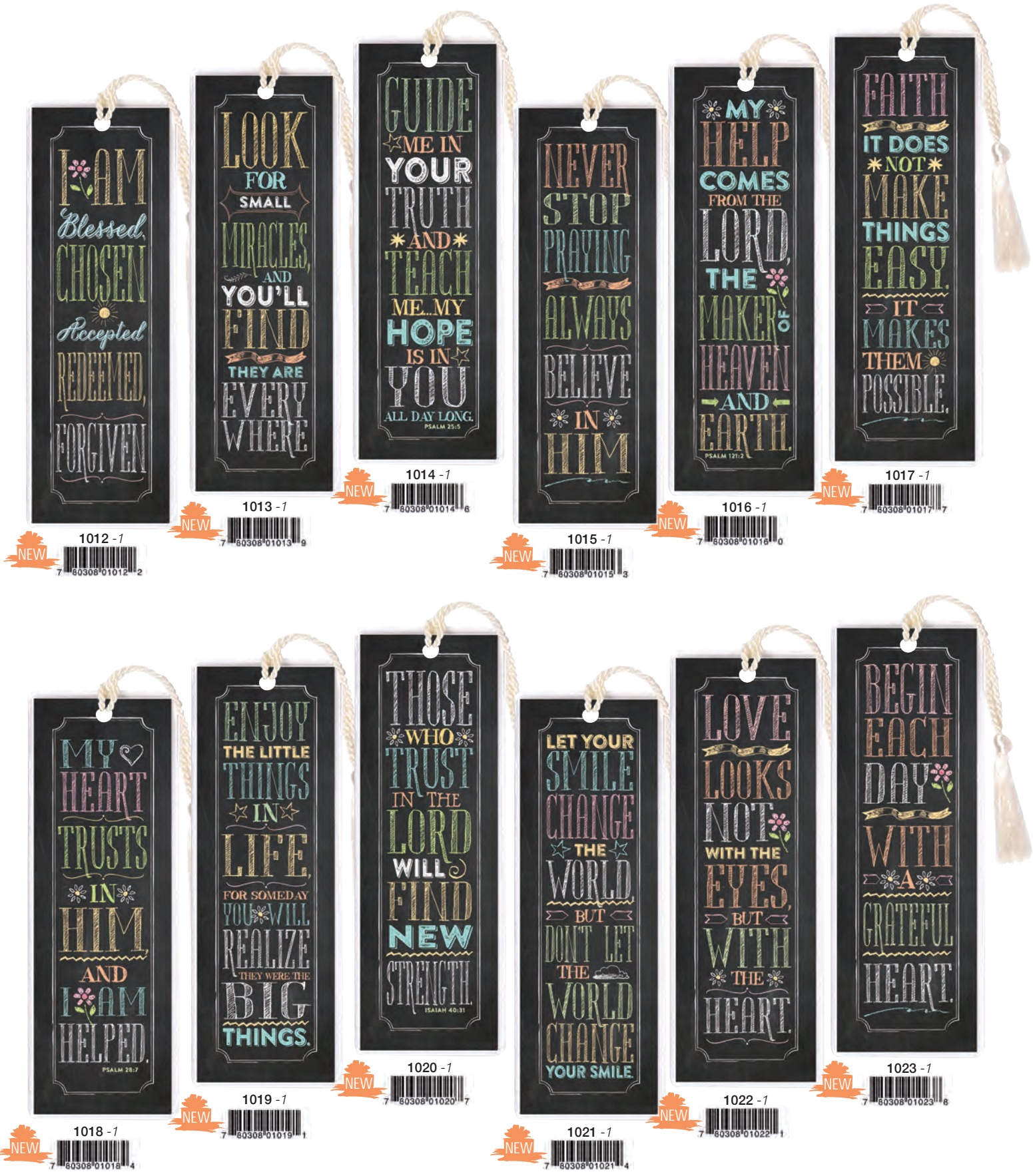
NEW 1012 - 1 7 60308 01012 2